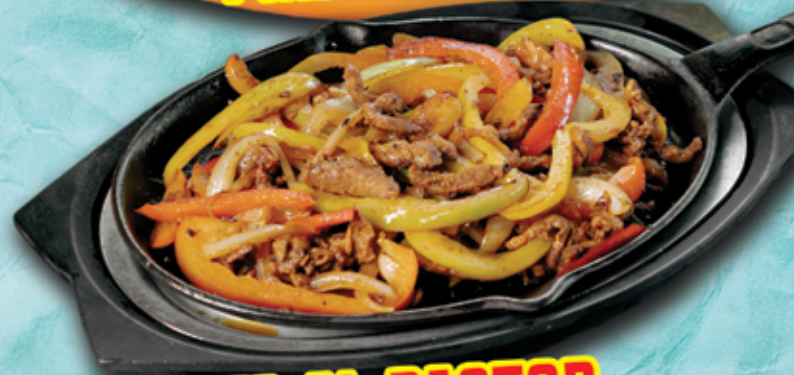
FAJITA AL PASTOR