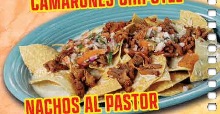
NACHOS AL PASTOR